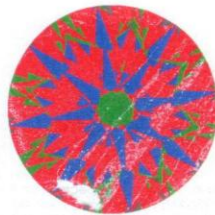
AGSL Computer Generated Light Performance Map for this Diamond. U.S. Patent No: 7,355,683

■ Brightness ■ Less Bright ■ Contrast ■ Light Leakage